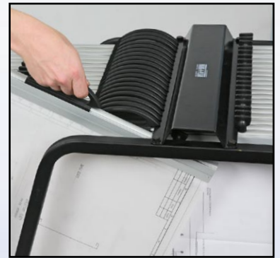
Easy Front Loading Access